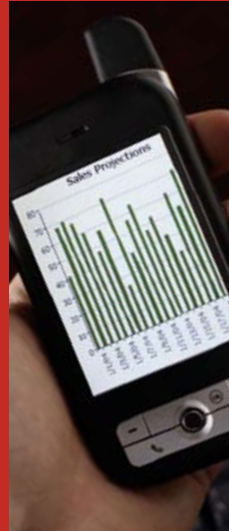
Shrink Management Software