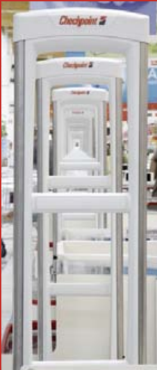
Electronic Article Surveillance

Checkpoint Systems is the leading supplier of shrink management solutions. Checkpoint's global team partners with retailers to reduce theft, achieve operational excellence, increase inventory visibility and provide customers with greater merchandise availability through a combination of advanced RF technology, a broad merchandise protection program, added-value software and real-time labeling solutions.